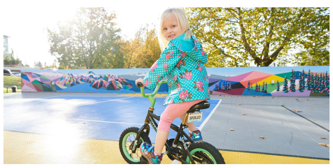
Step Up For Families April 2022 - Virtual

Assemble your team virtually to move 73 km in May while raising funds for RMH BC.