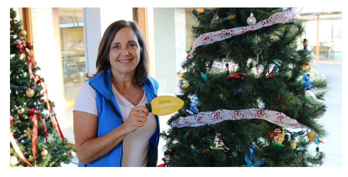
Light The House November - December 2022 Sponsor a tree at RMH BC or build your own

community tree to raise funds in your workplace.