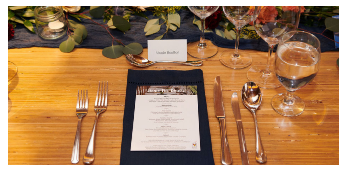
A Night to Dream Gala September 17, 2022

Assemble your team virtually to move 73 km in May while raising funds for RMH BC.