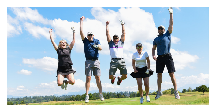
Vancouver Golf Tournament June 28, 2022 -Northview Golf & Country Club Join us for a round of golf for a great cause keeping families close when it matters most.

Enjoy an elegant evening in support of the children and families who depend on RMH BC..